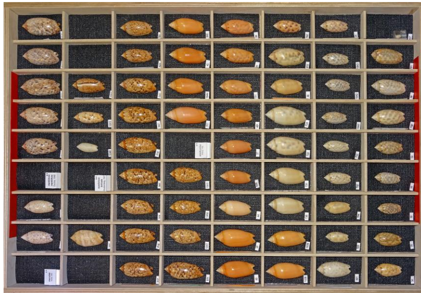
Figure 3 – One of the special storage drawers from the author's collection