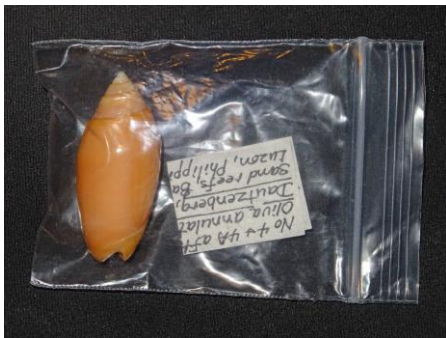
Figure 1 – An Oliva shell as received from the seller

This short paper is meant both as a specific reference procedure for the future maintenance of the author's collection of Oliva shells, and as an example for anybody interested in applying consistently a similar procedure to his own collection of biological or non-biological specimens. In particular, this paper will illustrate the successive steps that the author takes to get from a freshly bought specimen such as the one illustrated in Fig. 1, to a properly musealized specimen like the one illustrated in Fig. 2, stored in drawers similar to what is shown in Fig. 3. Those steps include the update of an offline database (an Excel spreadsheet) and an online photographic catalogue a screenshot from which appears in Fig. 4.