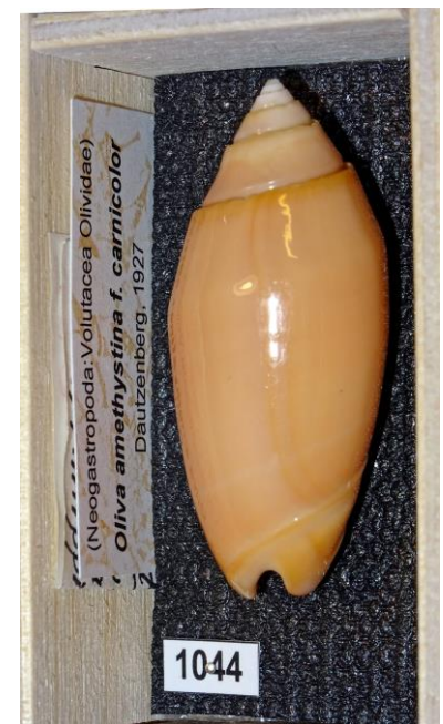
Figure 2 – The same shell stored in its own cell with a standard label for its key data and its unique identification number on a 10mm x 5mm label pinned to the cell bottom